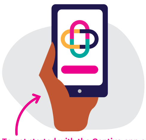
To get started with the Centivo app or member portal, you'll need to create an account with your Centivo member ID, which new members will receive with their welcome materials.